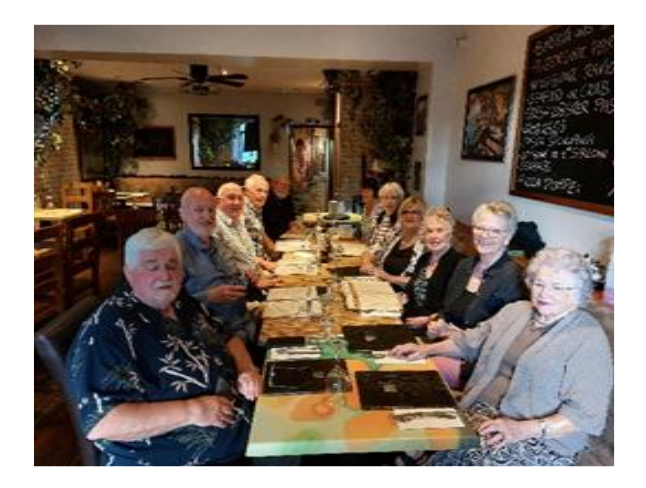
Italian Restaurant - final evening